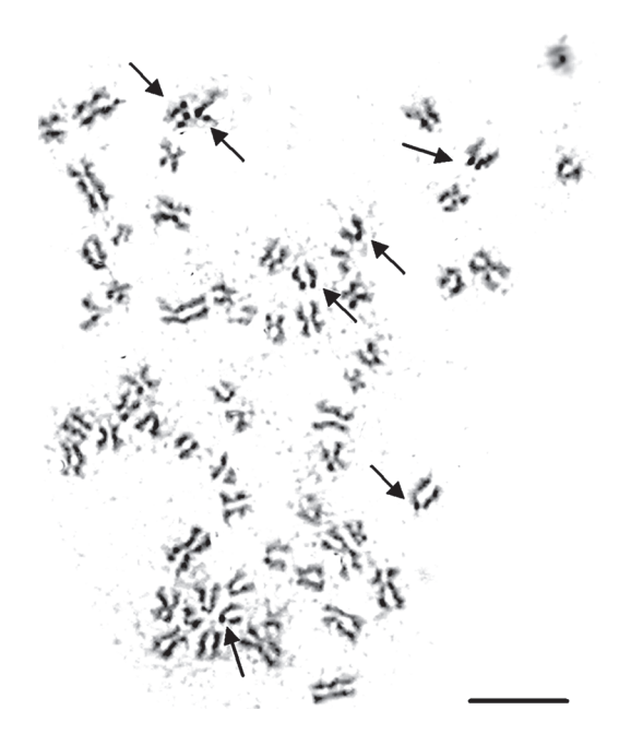
Figure 4. Chromosomes of W. pyrrhorhinus from Fazenda Salinas, Morro do Chapéu, Bahia: chromosomal distribution of Ag-NOR sites (arrows). Scale bar = 10 \mu m .

wide range of distribution with not yet detected morphological variation (GONÇALVES et al. 2005).